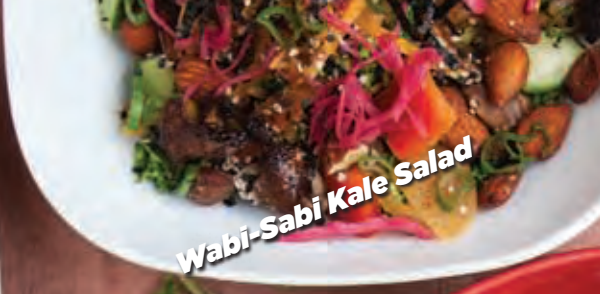
Wabi-Sabi Kale Salad