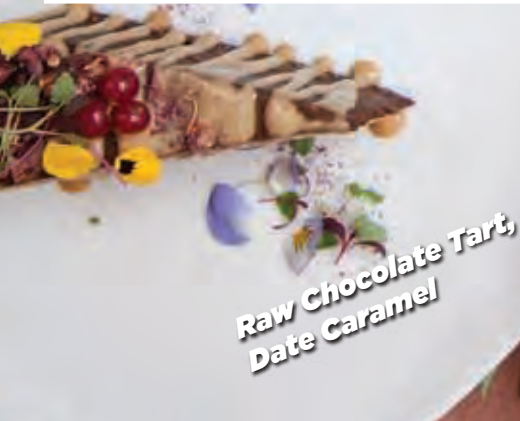
Raw Chocolate Tart, Date Caramel