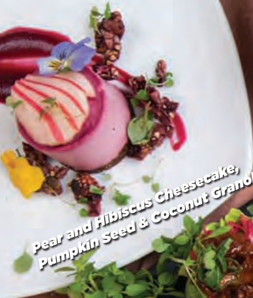
Pear and Hibiscus Cheesecake, Pumpkin Seed & Coconut Granola